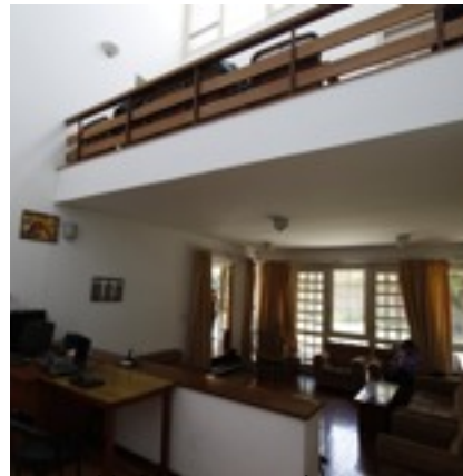
Modern two story home

Includes shared room (3-4 beds) breakfast and dinner, hot showers, internet on our computers or wi-fi, battery back up system for load shedding, courteous and professional English speaking Nepali staff, all house-keeping, internet phone for free calls back home, all bedding, blankets and towels. Home is 5 bedroom, 3 bath, gated compound and VIP location. Truly an international home away from home for volunteers from all over the world.